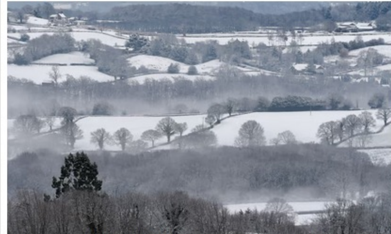
❄️ Snow in Derbyshire last December. The temperatures last winter are thought to have been partly to blame for the excess deaths.

Call for more NHS resources as elderly people and women among most vulnerable