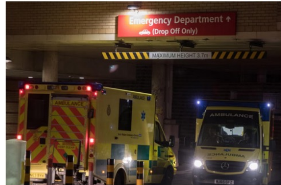
1,043 patients waited more than 12 hours from a decision to admit until their admission on to a ward in January

https://www.independent.co.uk/news/uk/home-news/nhs-hospital-patients-wait-corridor-trolley-stretcher-a8245091.html