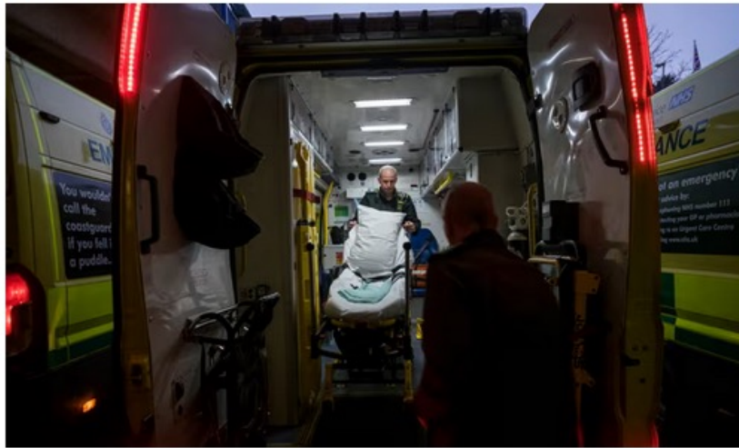
Last week ambulance crews had to wait outside A&Es in England 12,559 times.

Latest figures show almost a quarter of those had to wait at least an hour before being seen