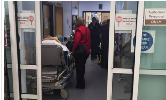
People waiting on trolleys, yesterday evening, in the A & E department at the Royal Glamorgan

Cancer operations were cancelled and a birthing centre closed last week as hospitals declared top level alert to cope with overcrowding